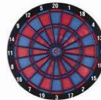
E- dart board grand size