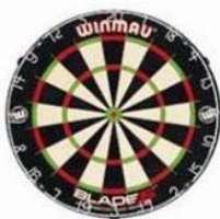
steel dart board standard size