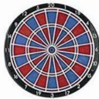
E- dart board standard size